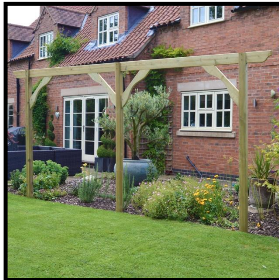
THE RUTLAND SCREEN PERGOLA