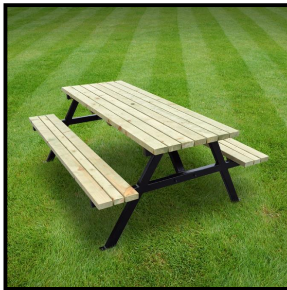
THE OAKHAM STEEL PICNIC BENCH