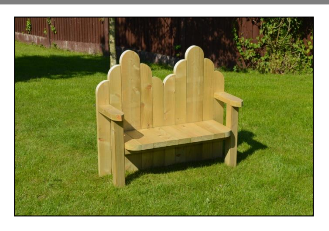
Your Story Bench Duo/Trio is now complete.

We hope that you found your product quick and easy to assemble but if not and you require any further assistance or have any questions you can contact us by telephone on: 01778 440803