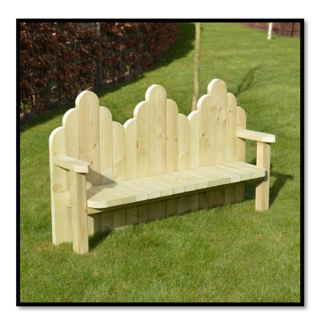
The Story bench trio

10mm socket or spanner Electric screwdriver with No2 Pozidrive bit Or No2 Pozidrive Screwdriver