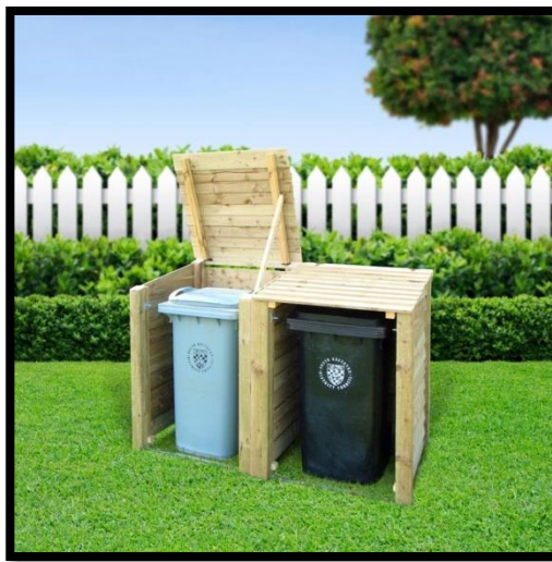
MORCOTT WHEELIE BIN STORAGE UNIT

Electric screwdriver with No2 Pozidrive bit Or No2 Pozidrive Screwdriver