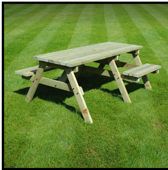
THE BISBROOKE DISABLED ACCESS PICNIC BENCH