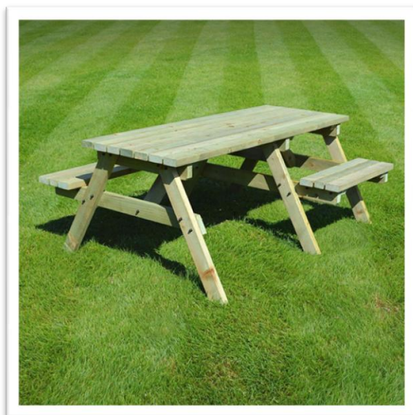
THE BISBROOKE DISABLED ACCESS PICNIC BENCH