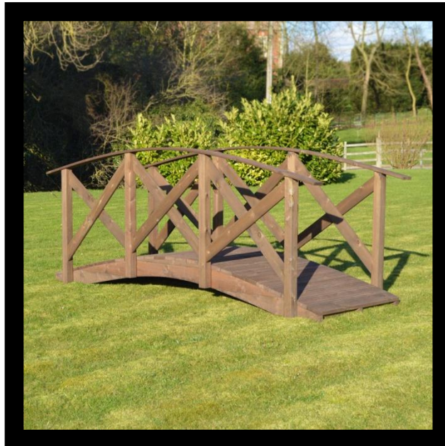
RUTLAND BRIDGE RANGE