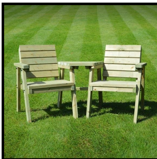
THISTLETON COMPANION SEAT/SINGLE CHAIR

10mm socket or spanner Broom handle or similar and spirit level for companion seat