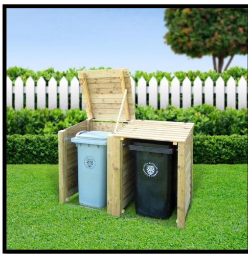
MORCOTT WHEELIE BIN STORAGE UNIT

Electric screwdriver with No2 Pozidrive bit Or No2 Pozidrive Screwdriver