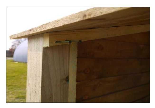
Check that the batten ends sit flush with the posts as shown. Now attach the roof to each end panel post with shorter green screws.