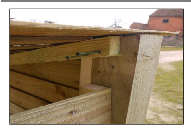
Secure the rear of the roof using shorter green screws as shown.