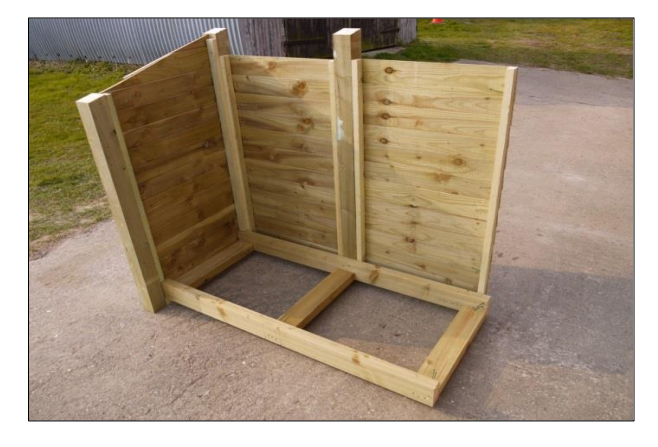
Remove the blocks from beneath the 2nd panel and then slide the base into position as shown, ensuring that the centre post and the central cross member of the base are aligned centrally.