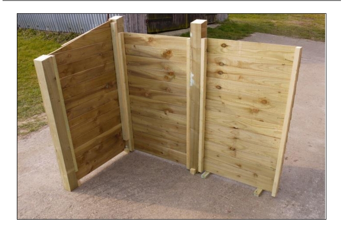
Rearrange the spacer blocks and offer up the next panel, aligning and attaching it as before.