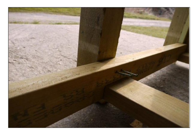
Check the positioning of the post within the guide marks once again before securing the bottom of the centre post with 2 of the longer green screws