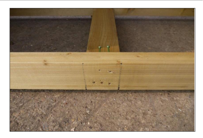
Locate the pencil guide marks on the front face of the base. This is where the centre posts will be fitted.