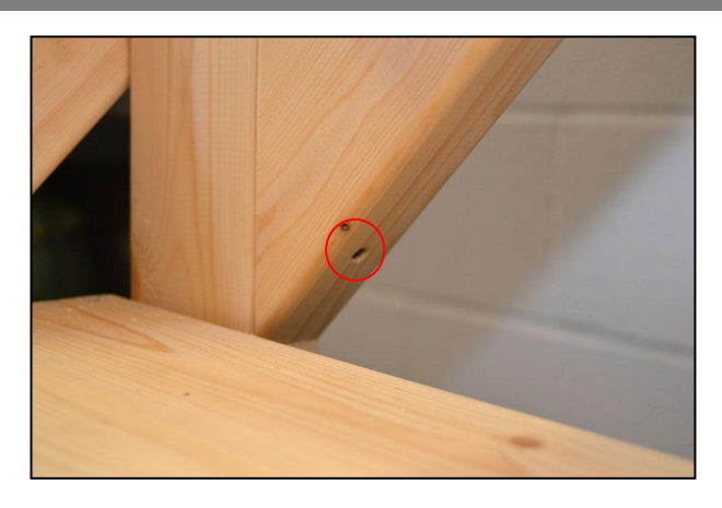
...and the lower end using a 75mm screw as shown here.