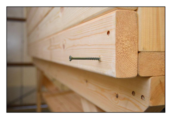
...and secure into place using 4 x 75mm screws. (45mm screws for MDF version)