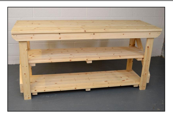
Lower the bench top into place...