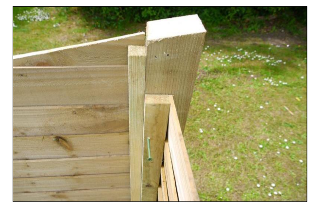
Using the shorter green screws provided, attach the batten on the back panel to the post of the end panel, ensuring that the batten remains vertically aligned to the post.