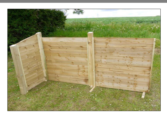
Rearrange the spacer blocks and offer up the next panel, aligning and attaching it as before.