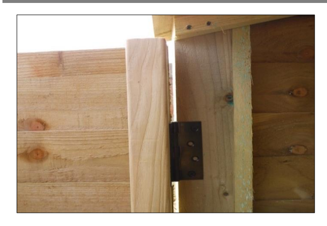
Align the top hinge in place, ensuring that the gap between the door and post is consistent at top and bottom.