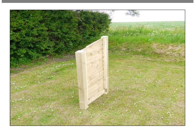
Stand the left hand end panel (or right hand for the reversed roof version) upright on a flat, level surface.