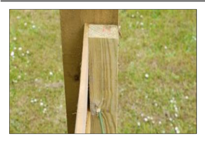
Attach the panel to the post by screwing through the batten using 65mm screws as before.