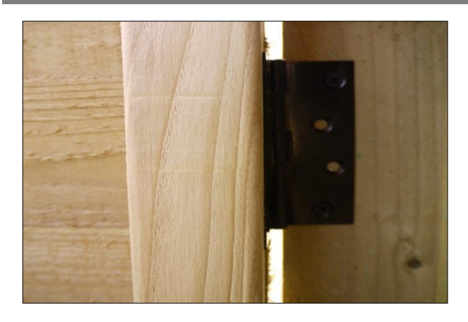
Secure the top hinge in place using more of the black hinge screws. Repeat steps 19 - 21 for any further doors as required.