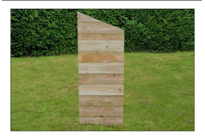
Next affix the partition panel to the centre posts of the store....