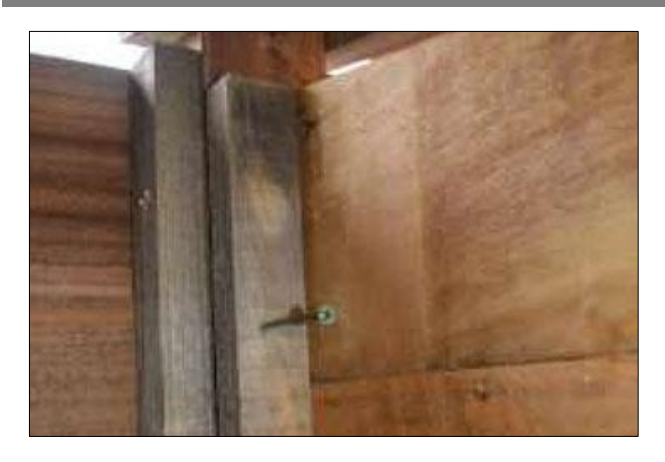
...by standing it in position and using the longer green screws, fix it to the rear post. The dividing panel needs to be a tight fit but if too snug then release the front centre post at the roof point...