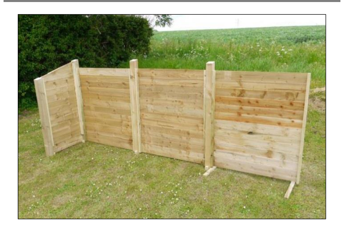
Repeat step 6 so that all 3 back panels are now attached.