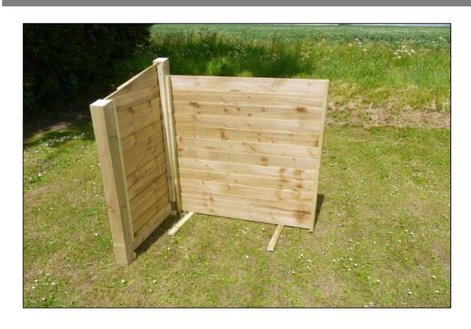
Arrange the 2 spacer blocks on the ground, adjacent to the end panel as shown in the photo above. Now place a back panel on the blocks, at 90° to the end panel, aligning the 2 panels ready for fixing.