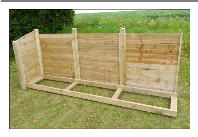
Remove the blocks from beneath the 3<sup>rd</sup> panel and then slide the base into position as shown.