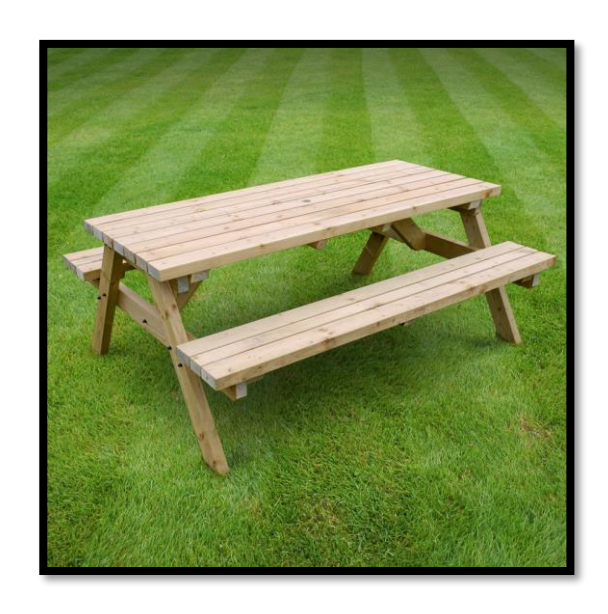
THE OAKHAM PICNIC BENCH