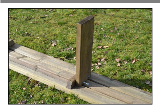
For a 7 or 8ft model, follow Steps 9 to 12. Place one of the seat panels upside on a flat surface and place the seat support adjacent to the centre batten...