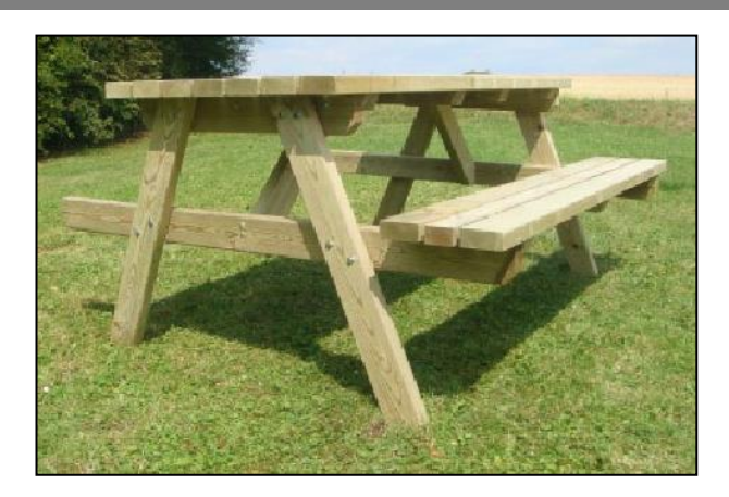
Place one of the seat panels in position as shown as and proceed to step 14.