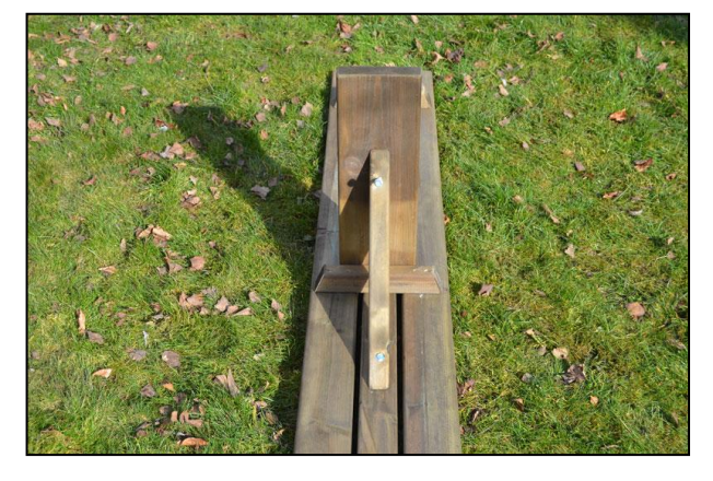
Now place the brace set support brace as shown so that it is also aligned centrally...