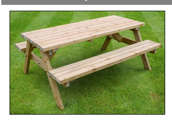
Finally, cover any exposed coach screw heads with the cover caps provided. Your Oakham picnic bench is now complete.

We hope that you found your product quick and easy to assemble but if not and you require any further assistance or have any questions you can contact us by telephone on: 01778 440803 Email: info@rutlandcountygardenfurniture.co.uk www.rutlandcountygardenfurniture.co.uk