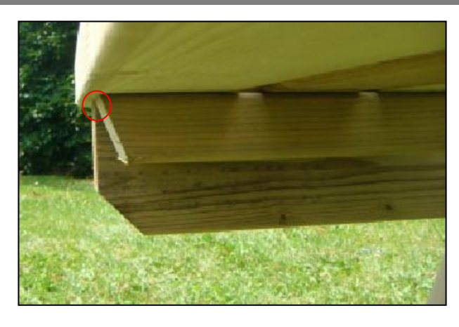
Align the seat panel batten with the outer end of the A-frame as shown and repeat for the other end of the seat panel.