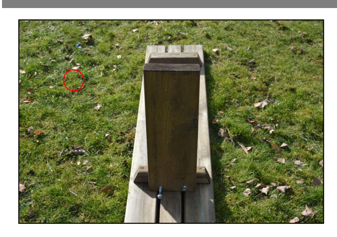
...and aligned centrally on the seat panel before fixing into place with 2 x 60mm coach screws as shown.