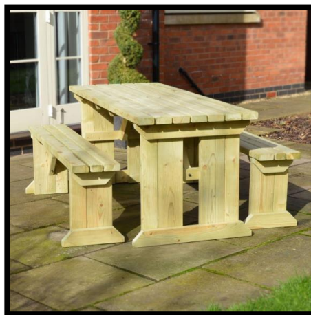
TINWELL PICNIC TABLE AND BENCH SET