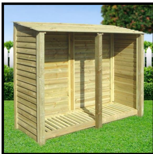
NORMANTON/HAMBLETON/COTTESMORE LOG STORE

Electric screwdriver with No2 Pozidrive bit Or No2 Pozidrive Screwdriver