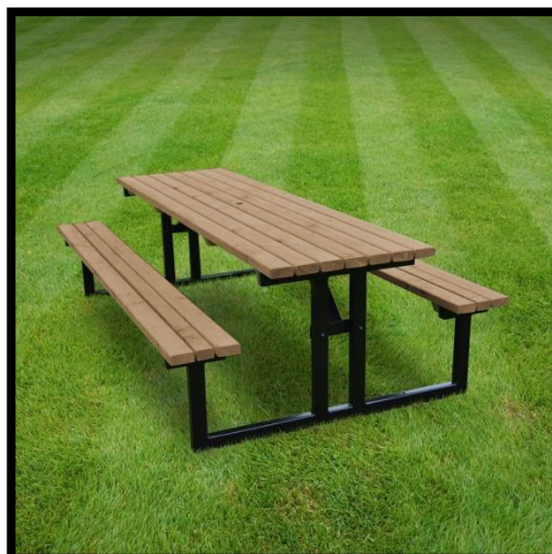
TINWELL STEEL PICNIC BENCH