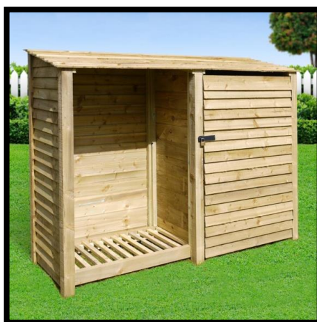
Normanton/Hambleton/Cottesmore 6ft tool store

Electric screwdriver with No2 Pozidrive bit Or No2 Pozidrive Screwdriver