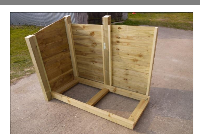
Remove the blocks from beneath the 2nd panel and then slide the base into position as shown, ensuring that the centre post and the central cross member of the base are aligned in the middle of the back assembly.