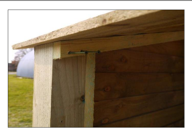
Check that the batten ends sit flush with the posts as shown. Now attach the roof to each end panel post with 65mm screws.