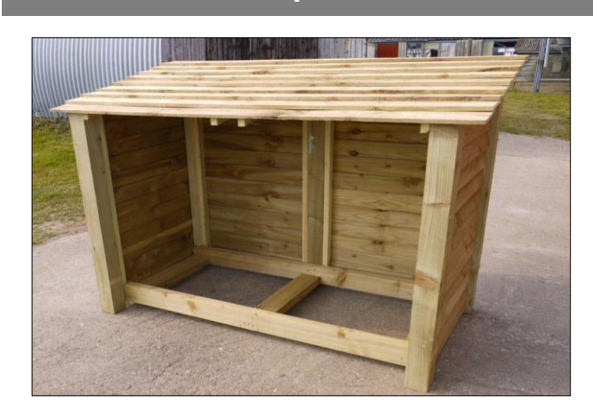
Carefully place the roof on top of the log store.