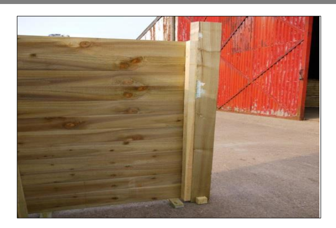
Align one of the longer posts (shorter for a reversed roof) with the other end of the back panel.