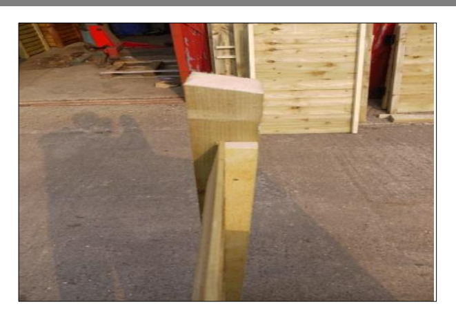
Attach the panel to the post by screwing through the batten using 65mm screws as before.