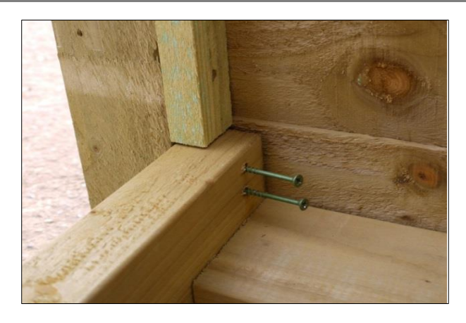
Attach the base to the end panel front post first, using 2 of the 85mm screws and then secure the rear post in the same way.