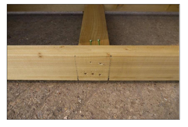
Locate the pencil guide marks on the front face of the base. This is where the centre posts will be fitted.