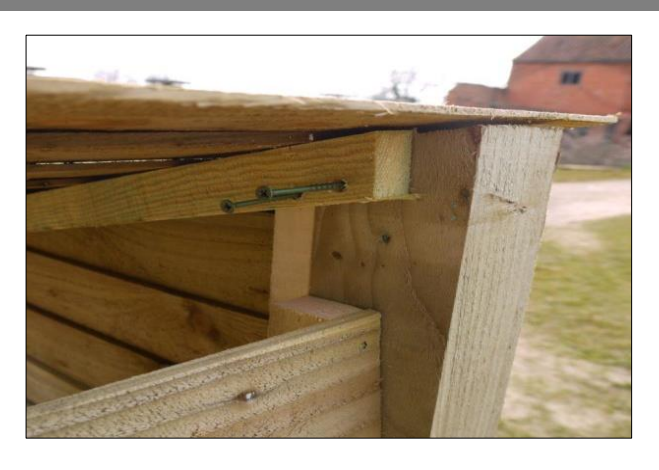
Secure the rear of the roof using 65mm screws as shown.