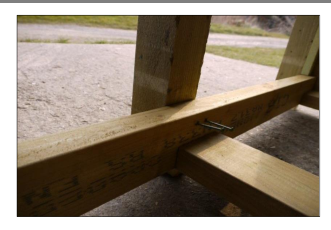
Check the positioning of the post within the guide marks once again before securing the bottom of the centre post with 2 of the 85mm screws