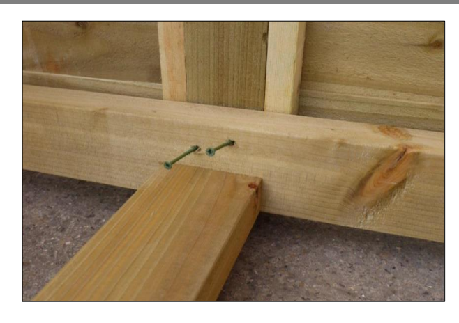
Using more of the 85mm screws now attach the base to the rear posts as shown.