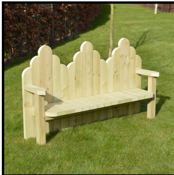
THE STORY BENCH TRIO