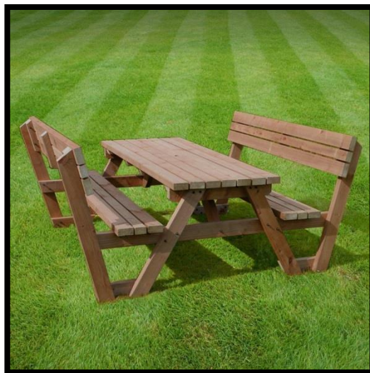
LYDDINGTON PICNIC BENCH