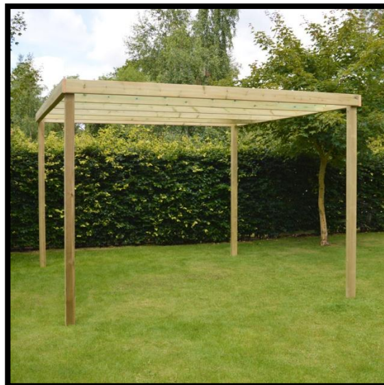
THE RUTLAND BOX PERGOLA

10mm socket drive or spanner Platform or Step ladder